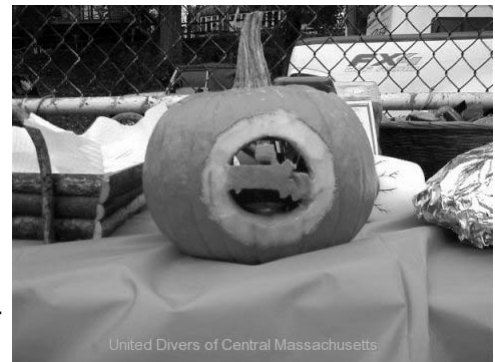
United Divers of Central Massachusetts

This year's annual underwater pumpkin carving contest will be held on Sunday, October 28th at 10am at either Mirror Lake in Devens, MA (still pending confirmation from the folks at Mirror Lake. An alternative location will be Lake Whalom in Lunenburg, MA. A definitive location will be determined at the October meeting) All participants must bring their own pumpkins already gutted and ready to be carved. Gutting of pumpkins will not be allowed on the beachfront. Pumpkins will not be supplied. A separate carving contest will be held for those "land lubber" members who are not brave enough to venture into the water. A small fee of $8 per person will be charged, which covers a $1.50 beach rental usage per person and also a hamburger and hot dog lunch. Sign up at the October monthly meeting. Join us for Halloween fun and great prizes!